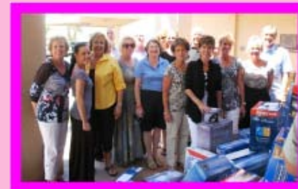
Windermere Real Estate employees with donated fans.

Thank you again to Windermere Real Estate Southern California, and to everyone who has ever donated to the Fan Club. You have made a difference in the lives of many!