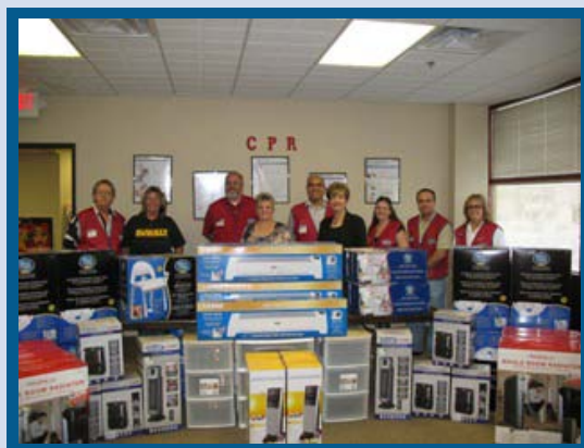
Lowe's Home Center Heroes present their donation.

The VNAIC has offices in Barstow, Victorville, Banning, Yucca Valley, Palm Desert, Riverside and Murrieta. For more information on The Nightingale Society or the VNAIC, call (760) 773-6260.