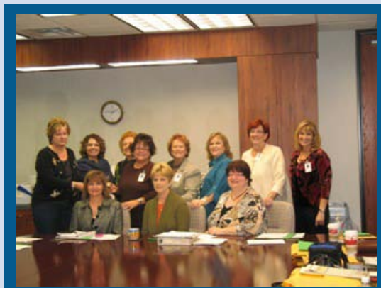
Society members present food cards to Hospice Directors.