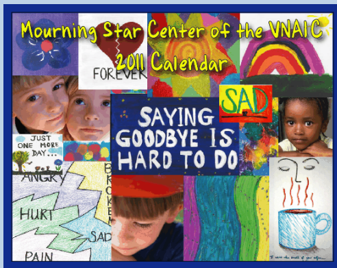
Calendar - $10